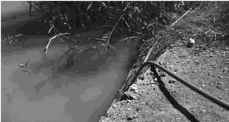
River Segura in Murcia. Willie Doherty. 2010

OVERSCORE is a project held together by the logic that The Theory of Applied Enigmatics outlines and oversees one project with four components, spread across three venues. OVERSCORE features works and contributions by 38 artists and collaborators. The exhibition component presents newly-commissioned and existing works by 27 artists and collectives, and is hosted at the ANTIGUA OFICINA DE CORREOS Y TELÉGRAFOS (former central post-office) in Murcia and the ARQUA (Museum of Underwater Archaeology) in Cartagena. ESPACIO AV in Murcia is the venue for the project entitled The MoCHA Sessions , one of three special projects integrated into the general fabric of OVERSCORE . The other special projects are Backbench and Prayers for Art .